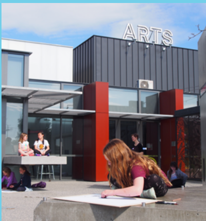
Above A drawing workshop from 2019.

After closing to the public during the COVID-19 pandemic, the Moonah Arts Centre (MAC) has reopened its doors, with an exciting program of exhibitions scheduled for the rest of the year.