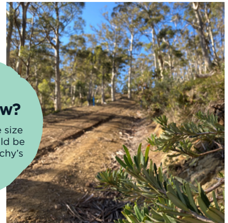
Above During spring the Bushfire Mitigation Team focuses on maintenance works of the fire trail network in bushland areas and site preparation for the spring 2020 planned burning program in Goat Hills adjacent to Wellington Park.

Did you know? Over 300 bats the size of your thumb could be sleeping in Glenorchy's tree hollows