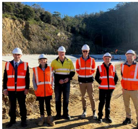
Onsite at the landfill cell extension at Jackson St. This project is part of Council's Waste Management Strategy